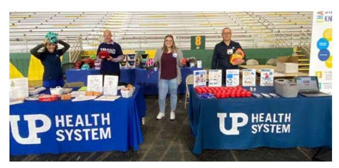
Employees from Marquette and Bell represent UP Health System at the Marquette County Resource Fair.